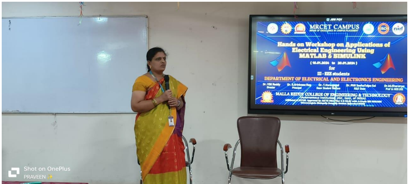
Addressing dignitaries on the Dias