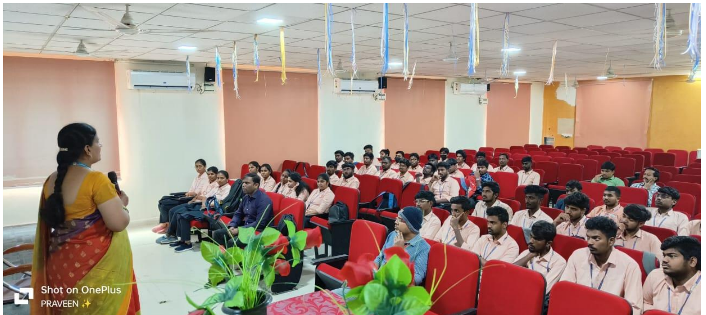
Addressing the students in seminar hall