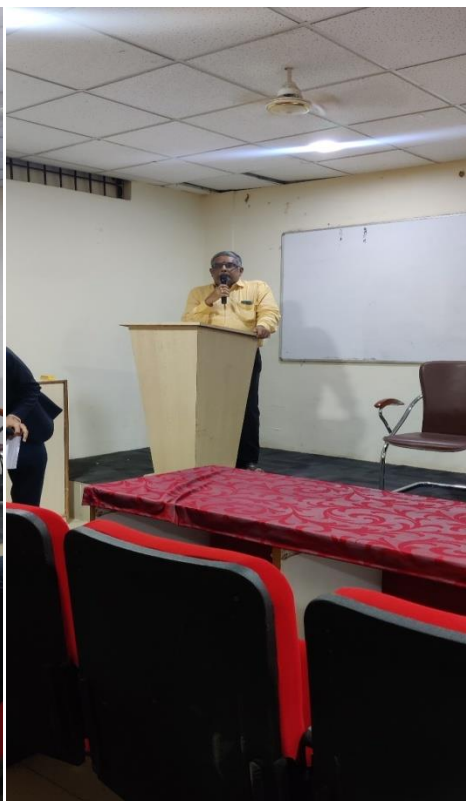
Addressing students by HOD and Dean R&D