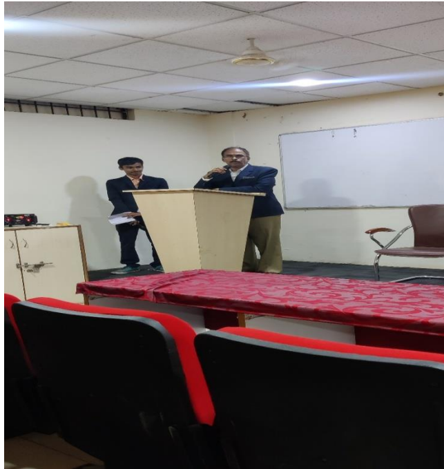
Addressing students by Principal and Dean